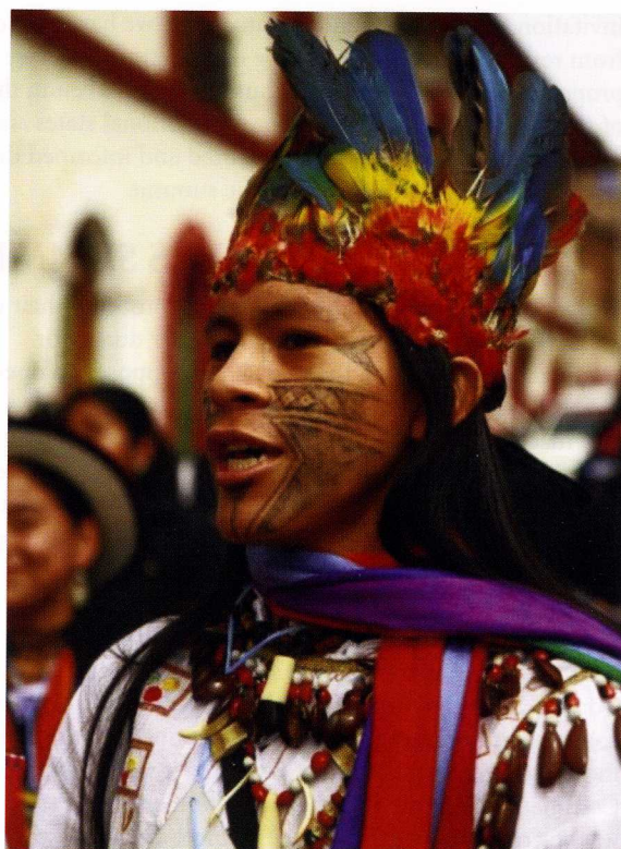
Puno, Peru.

At the 2007 Guatemalan gathering, Argentine delegates proposed holding the Fourth Summit of Indigenous Peoples and Nationalities on the Chilean side of the triple Peru/Bolivia/Chile border. Although such a spot was politically significant, the logistical demands of bringing thousands of people to a remote location proved to be too daunting. The Guatemalan summit had left a local organizing committee in charge of arranging the specific details, and they decided a better site would be the tourist city of Puno. This location provided both an abundance of hotel rooms, a conveniently located airport, and the support of the municipal government. Holding the meeting in Peru also proved to be a politically astute choice given the presence of a growing and increasingly powerful Indigenous movement in that country. 3 Although not a direct outcome of the summit, an Indigenous strike in the Peruvian Amazon leading to a massacre the week after the summit further turned the world's attention to Peru, placing it directly in the midst of debates concerning environmental issues, the crisis of the capitalist system, and the collapse of western civilization.