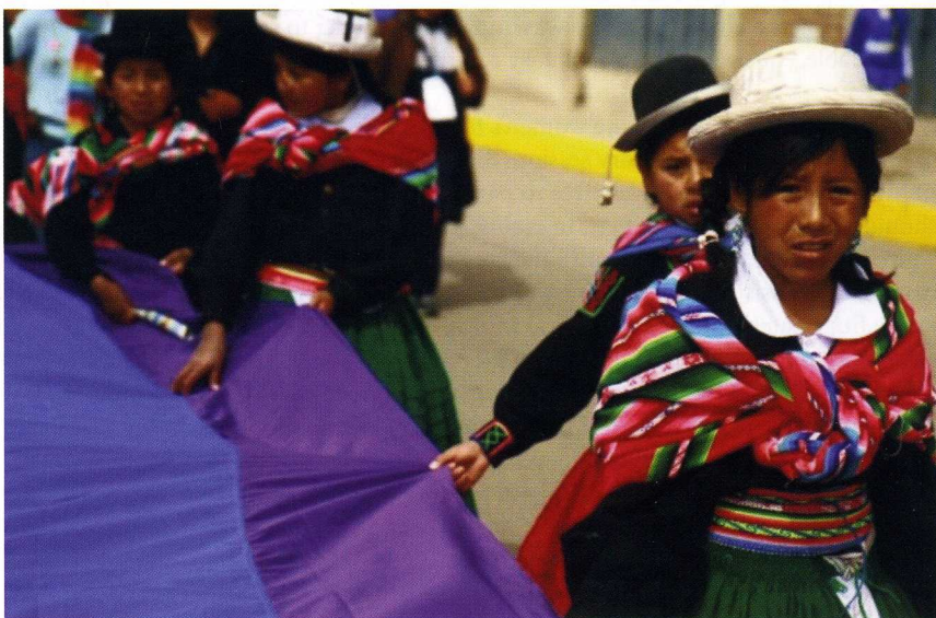
Puno, Peru.

In parallel to the Indigenous and women's summits, hundreds of Indigenous youth and children held their second encounters in Puno in which they discussed and debated their own interests. These meetings followed on the heels of similar gatherings held in 2007 at the Guatemalan summit that were designed to overcome the economic, cultural, social, and political exclusion of Indigenous youth and children. In Peru, for two days the youth engaged similar topics of discussion (plurinational states, crisis of capitalism, territory, identity, education, health care) as the main summit. Similar to the women's summit, a difference from the general gathering was that this was a youth organized and led meeting. Meeting in a noisy auditorium on the university campus, the high energy discussions culminated in a plenary session that consolidated their main concerns and interests.